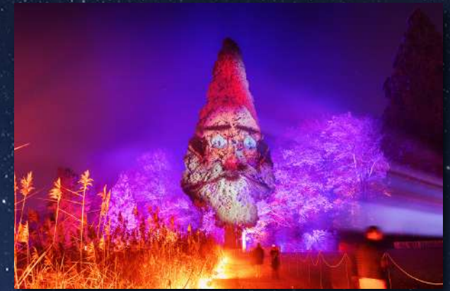
... AND TALKING TREES!