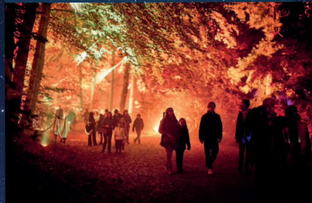
TUNNELS OF LIGHT