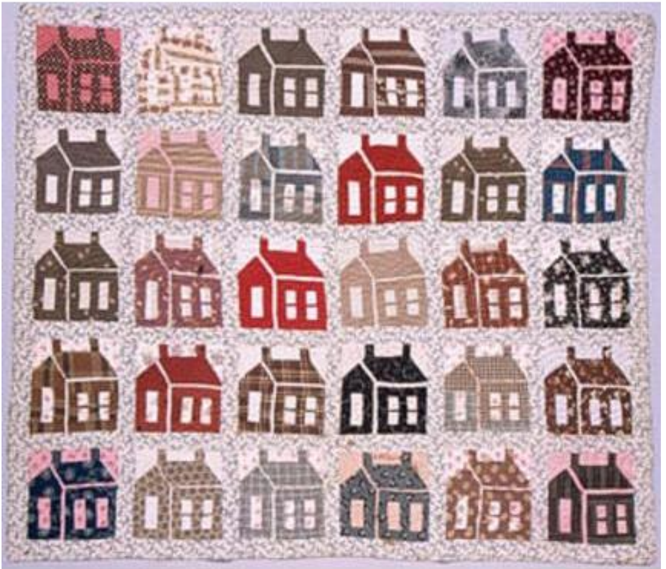
Pieced Quilt with House Pattern. c.1850-80