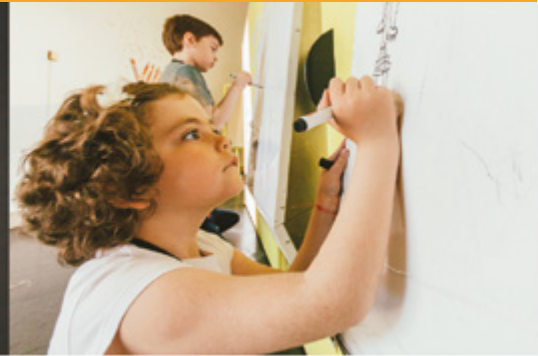
IS THIS CONTAGION?

In addition to cells, there are millions of bacteria, fungi and viruses in our body. This scale will reveal how much of our weight isn't really yours.