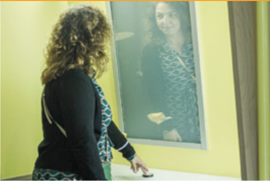
THE ULTIMATE AGENT OF CONTAGION

In this exhibit there is a button that will reveal you the biggest contagion agent. Get ready to be surprised!