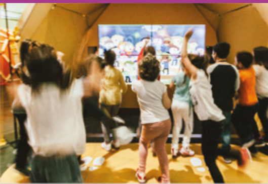
BE THE TRIGGER

Dance. Clap your hands. Start a wave in a stadium. Here the task is easy: be the trigger and infect the crowd as much as possible!